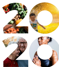
Healthy People 2020 An End of Decade Snapshot

Click here for details on these and more Headlines!