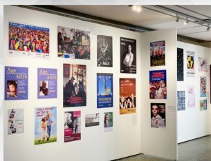
A MATTER OF TIME: EXAMINING FORTY YEARS OF AIDS WHILE LIVING THROUGH A PANDEMIC APRIL 8, 2021 - JULY 18, 2021 CLEAR HEALTH ALLIANCE powered by McAfee