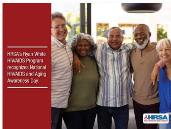
HRSA's Ryan White HIV/AIDS Program recognizes National HIV/AIDS and Aging Awareness Day.

(CDC.gov) A status neutral approach to HIV-related service delivery aims to deliver high-quality, culturally affirming health care and services at every engagement, supporting optimal health for people with and without HIV. Click here for more.