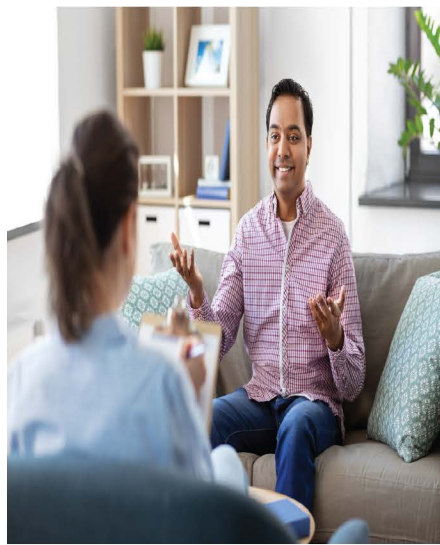
BEHAVIORAL HEALTH SERVICES